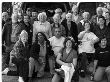
SENIORS AND FRIENDS HIT THE ROAD FOR THEIR ANNUAL RETREAT.

For the fourth year, LVPC's Senior Site joined Uptown Ministries for a three-day retreat to Lutherdale Retreat Center in Elkhorn Wisconsin. Eleven participants came from our senior site, including six retreat newbies, while there were five participants from Uptown Ministries.