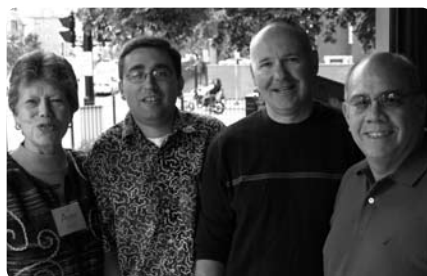
HELP SHAPE LVPC'S FUTURE WITH THE ON HOLY GROUND COMMITTEE

Still searching for a special spot to get involved? Never fear! Check out part two of the "Give Back Guide!" Whatever your interest or skill, we have a place for you!