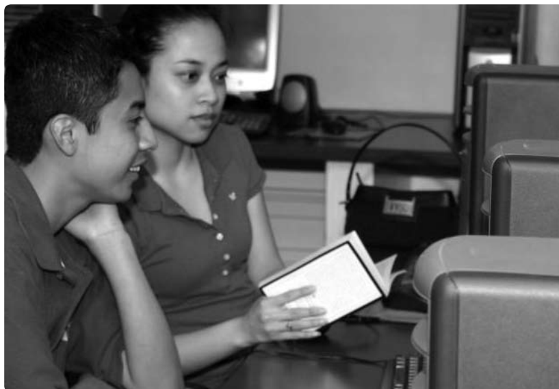
YOUTH IN ERIE HOUSE'S TECHNOLOGY SERVICES

There are many connections between LVPC and Erie Neighborhood House. That's not surprising, because Erie House's services touch lives all over Chicago.