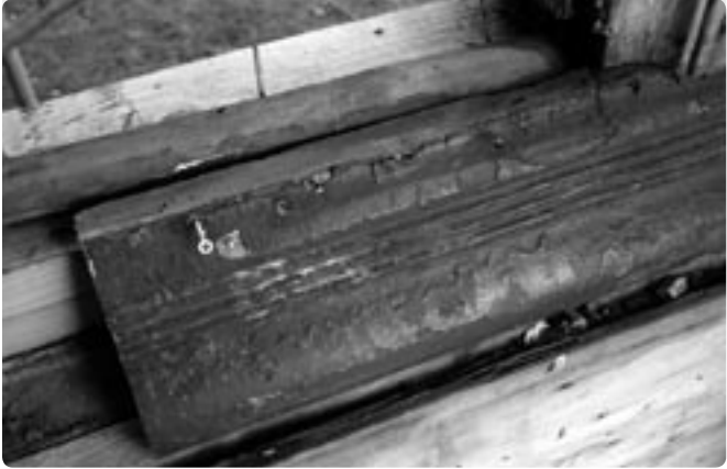
THERE WERE LAYERS AND LAYERS OF LEAD PAINT ON LVPC'S EXTERIOR TRIM. IT WAS CAREFULLY REMOVED BY A LEAD ABATEMENT CONTRACTOR.